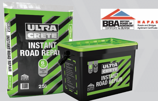
New Packaging from Nov 2010!